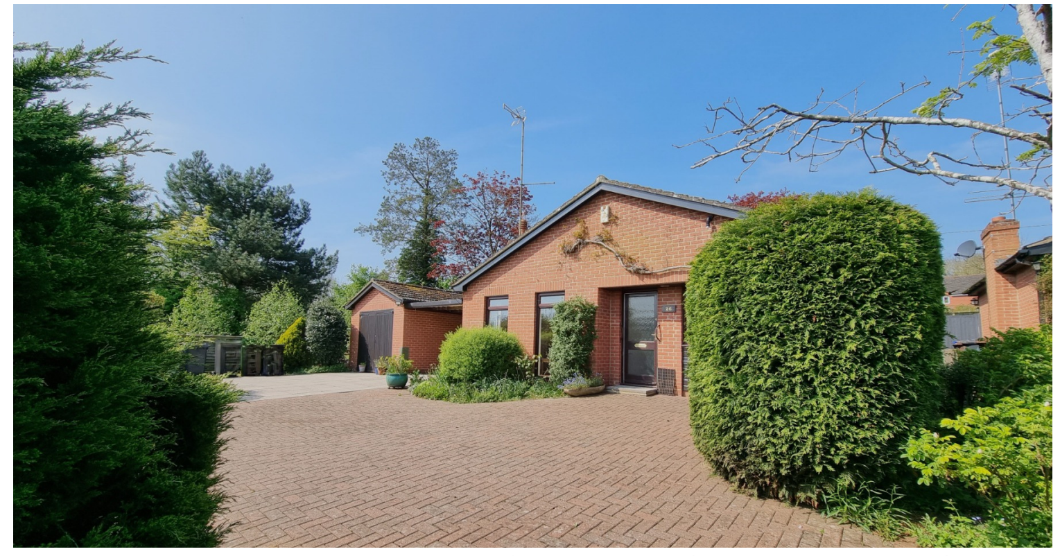
3 Bedrooms | 1 Bathroom | 2 Reception Room | Garage