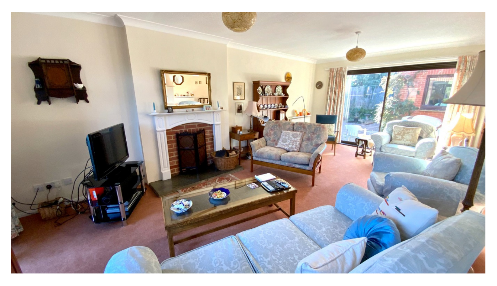
Situated on a substantial plot on the edge of a quiet and popular village this three double bedroom, detached bungalow for sale in Woodford Halse with a single garage, ample off road parking, countryside views from the front and no upper chain, will not disappoint.

Internally the property is in nice condition offering plenty of space, a great sized L-shaped lounge/diner which gets plenty of natural sunlight and really sets the scene of what is to come from this bright and spacious home. The property which is in a quiet location offers ample off road parking, mature private and sunny front and rear gardens and a secluded side patio for those warm, summer evenings. The accommodation is bright and spacious and consists of an entrance hallway with a storage cupboard which leads to a large open L-shaped lounge/diner with a feature open fireplace, distant countryside views from the front windows and sliding patio doors onto a secluded patio area. A glazed door from the lounge/diner leads you into a nice-sized fitted kitchen/breakfast room with breakfast bar and sliding patio doors offering access to a patio area and the property's rear garden. he rear hallway which is accessed from the kitchen leads you to three good sized double bedrooms, bedrooms one and two have built-in double wardrobes, there is also a replaced