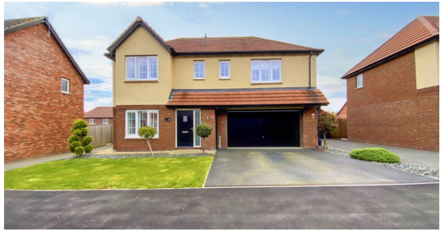
5 Bedrooms | 3 Bathrooms | 2 Reception Rooms | Double Garage