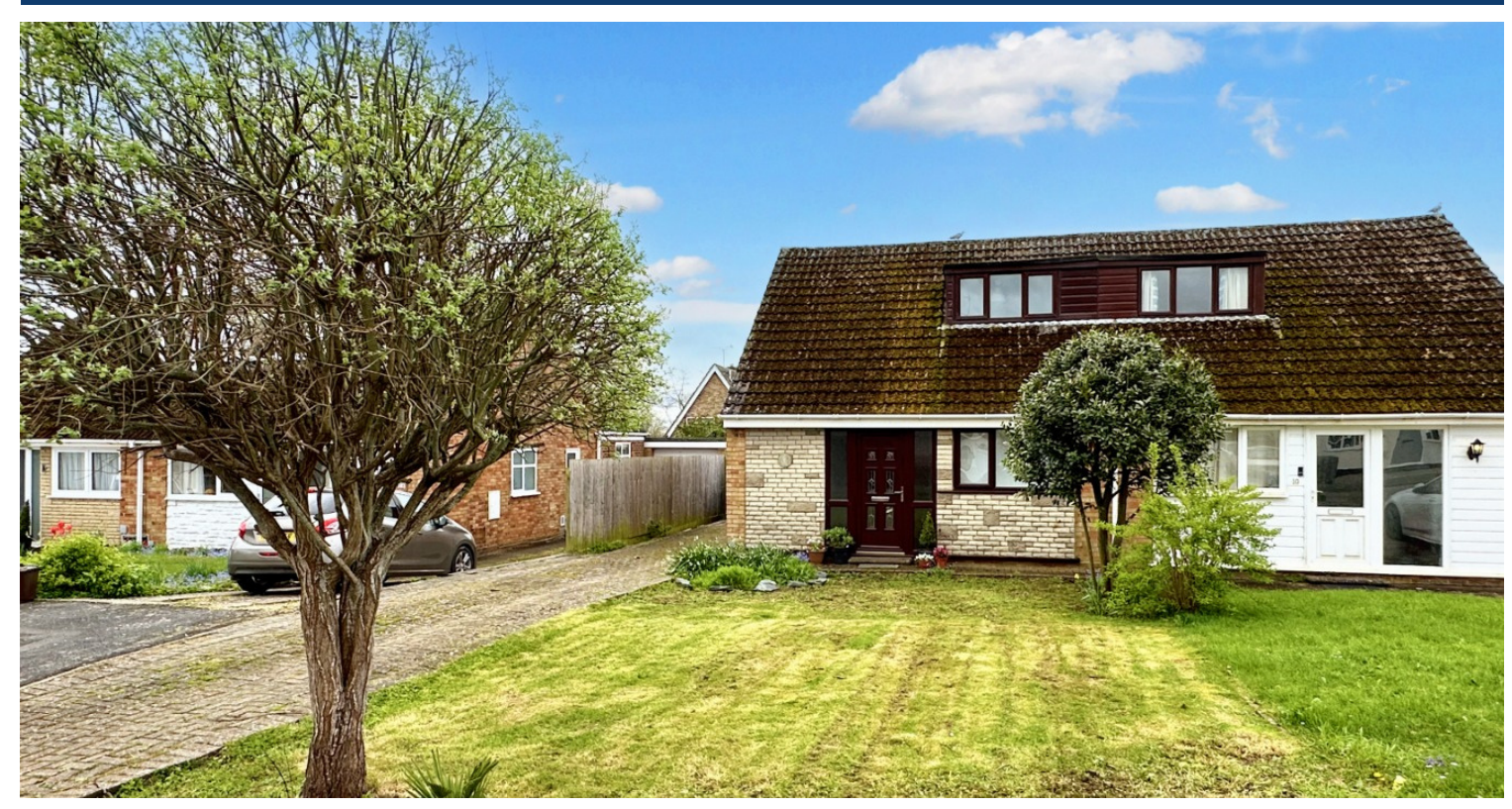
3 Bedrooms | 1 Bathroom | 1 Reception Room | Garage