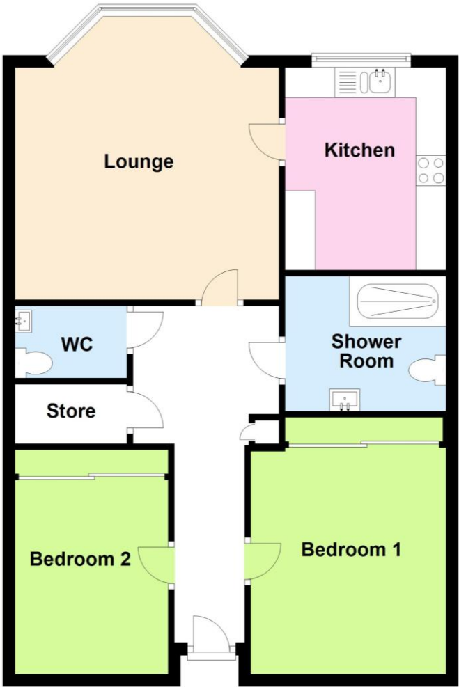
Floor plans are for illustration only and not to scale Plan produced using PlanUp.