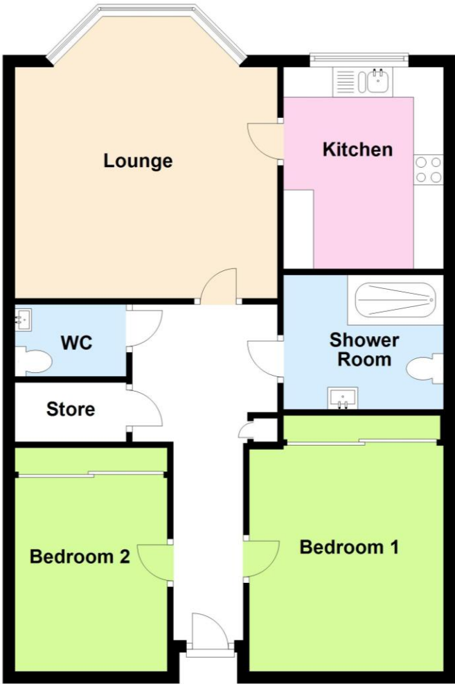
Floor plans are for illustration only and not to scale Plan produced using PlanUp.