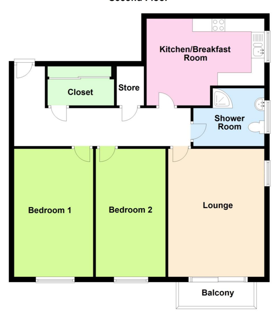
Floor plans are for illustration only and not to scale Plan produced using PlanUp.