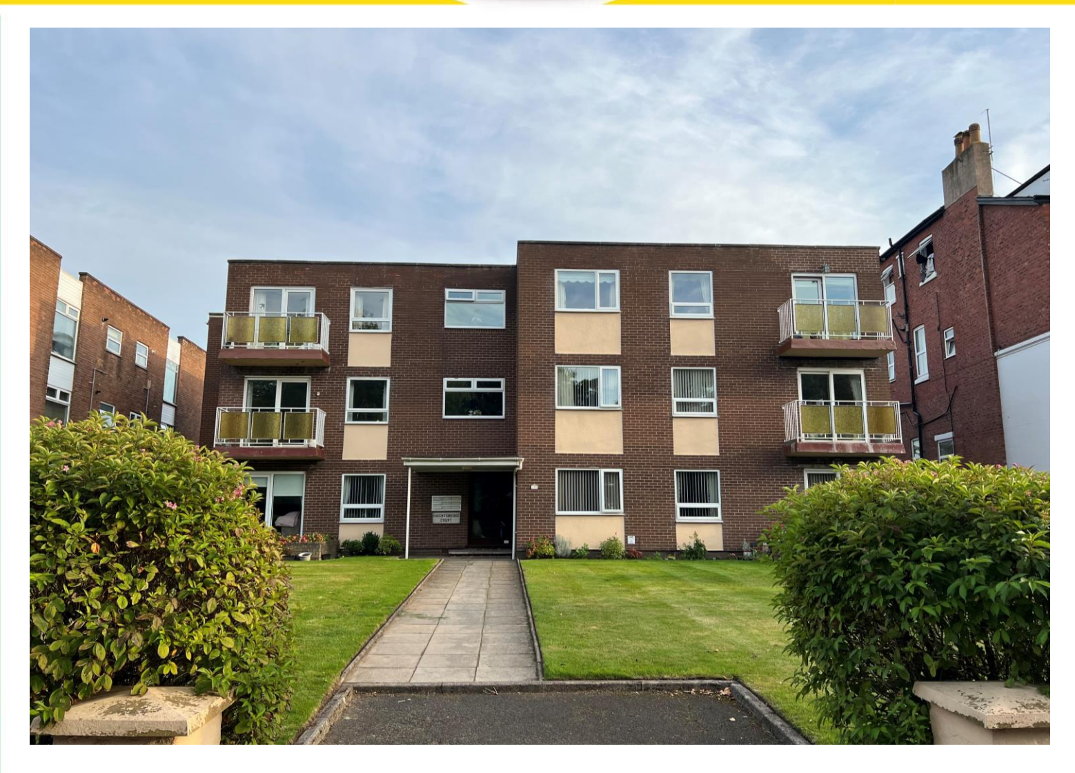
Flat 8, Knightsbrige Court, Park Crescent Hesketh Park, Southport, PR9 9NW £150,000 Subject to Contract

An early viewing is recommended to appreciate the extent of the accommodation offered by this flat, situated on the second floor of a purpose built development of just 9 flats in total. The centrally heated and double glazed accommodation briefly includes; communal entrance with entry phone system and stairs to the second floor, private entrance hall with useful storage cupboards, lounge with a tiled balcony overlooking Hesketh Park, dining kitchen with built in appliances, two bedrooms both overlooking Hesketh Park and shower room and WC. Knightsbridge Court stands in communal gardens and a garage is located at the rear. The flat is situated in a popular and sought after location overlooking Hesketh Park with passing bus services providing access to the nearby facilities at Southport Town Centre and Churchtown Village.