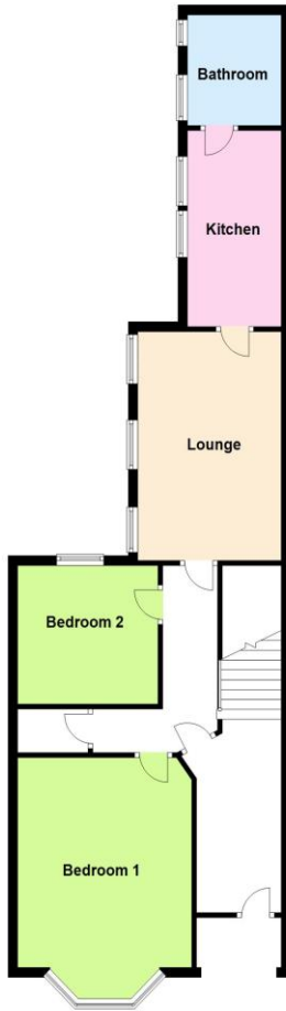
Ground Floor Flat