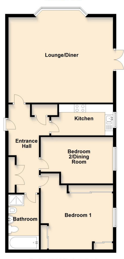
Floor plans are for illustration only and not to scale Plan produced using PlanUp.