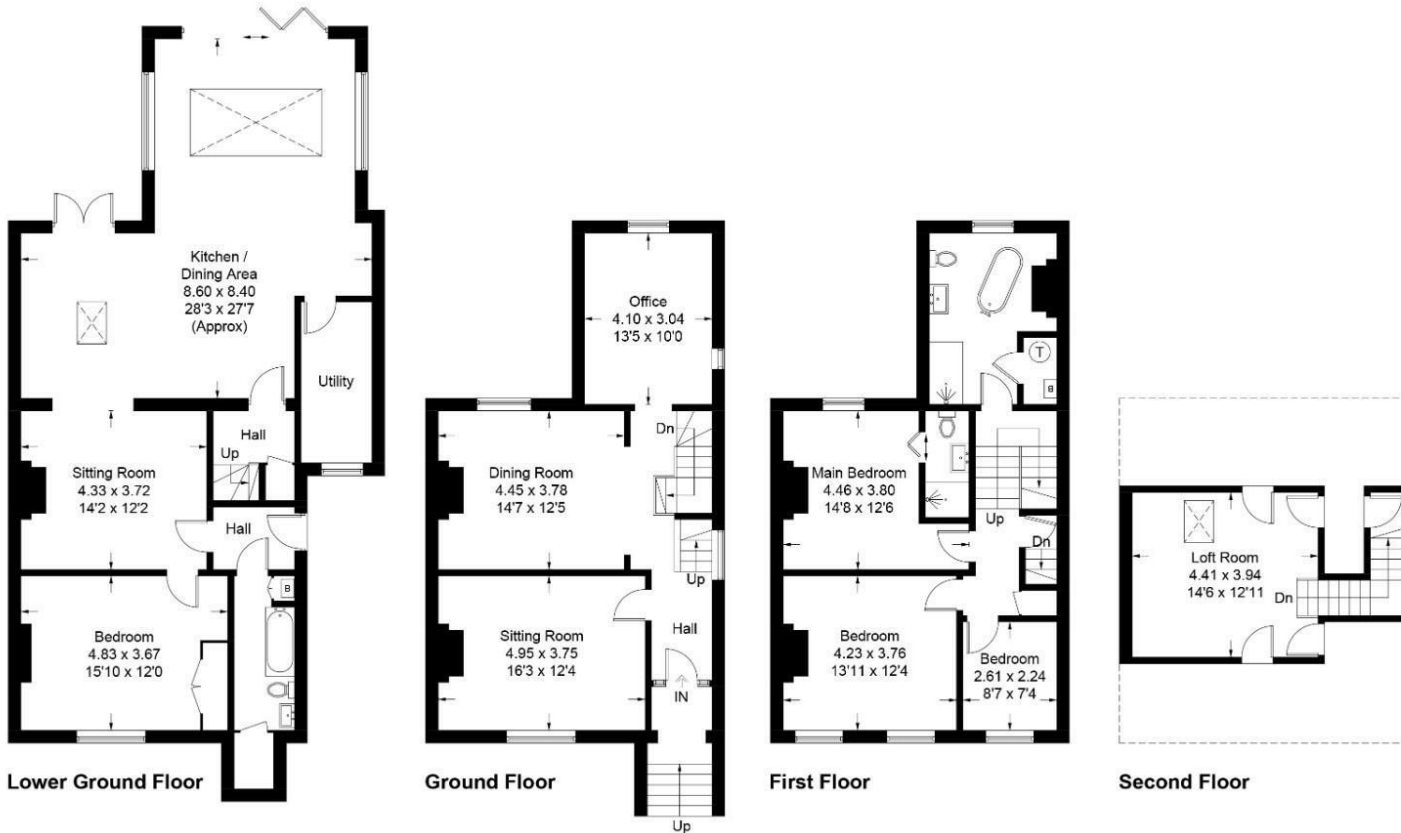
Illustration for identification purposes only, measurements are approximate, not to scale. floorplansUsketch.com © (ID1103898)