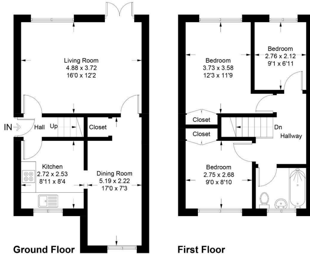
Illustration for identification purposes only, measurements are approximate, not to scale. floorplansUsketch.com © (ID1084078)