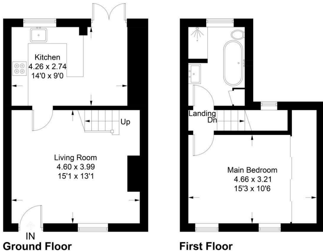
Illustration for identification purposes only, measurements are approximate, not to scale. floorplansUsketch.com © (ID1077835)

Approximate Gross Internal Area = 57.2 sq m / 616 sq ft