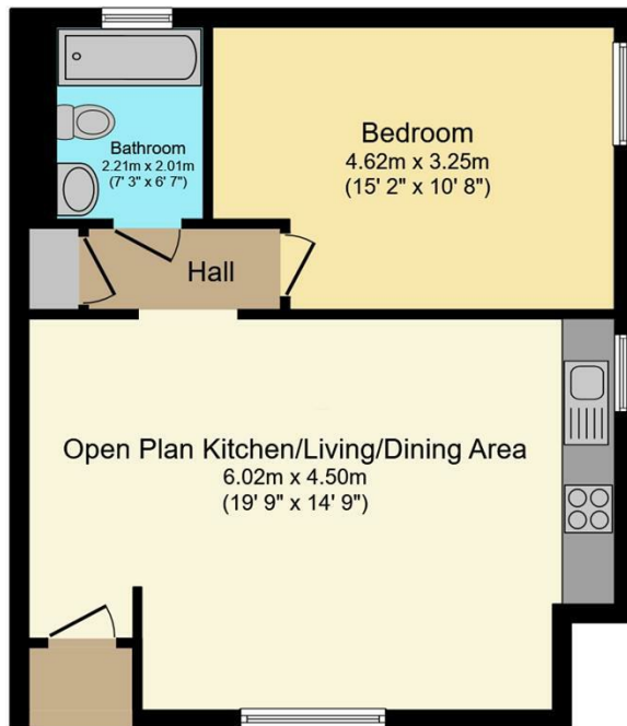
Floor Plan Floor area 52.0 m 2 (559 sq.ft.)