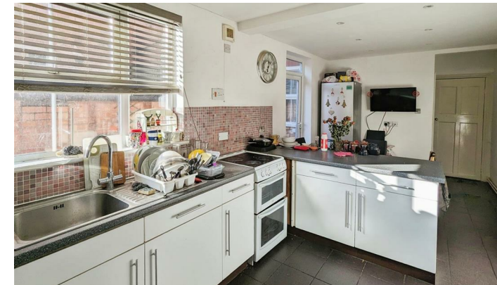
Rugby CV21 2RR