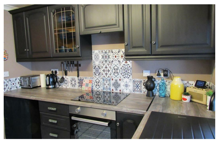
107 Mortimer Street, Herne Bay, Kent, CT6 5ER www.wilbeeandson.co.uk