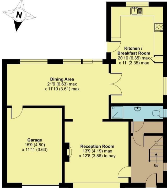
GROUND FLOOR APPROX FLOOR AREA 91.5 SQ M (985 SQ FT)