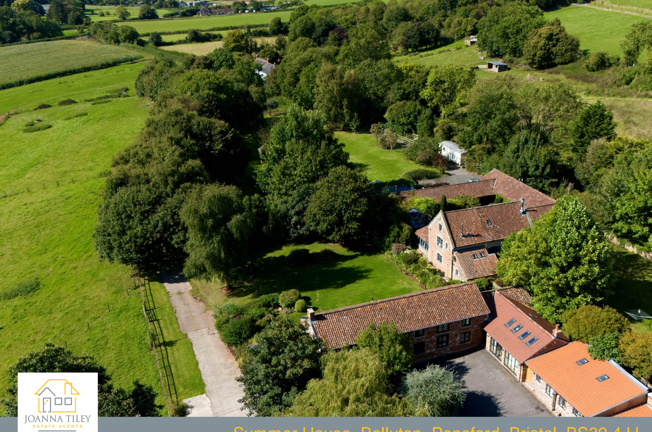
Summer House, Belluton, Pensford, Bristol, BS39 4JJ