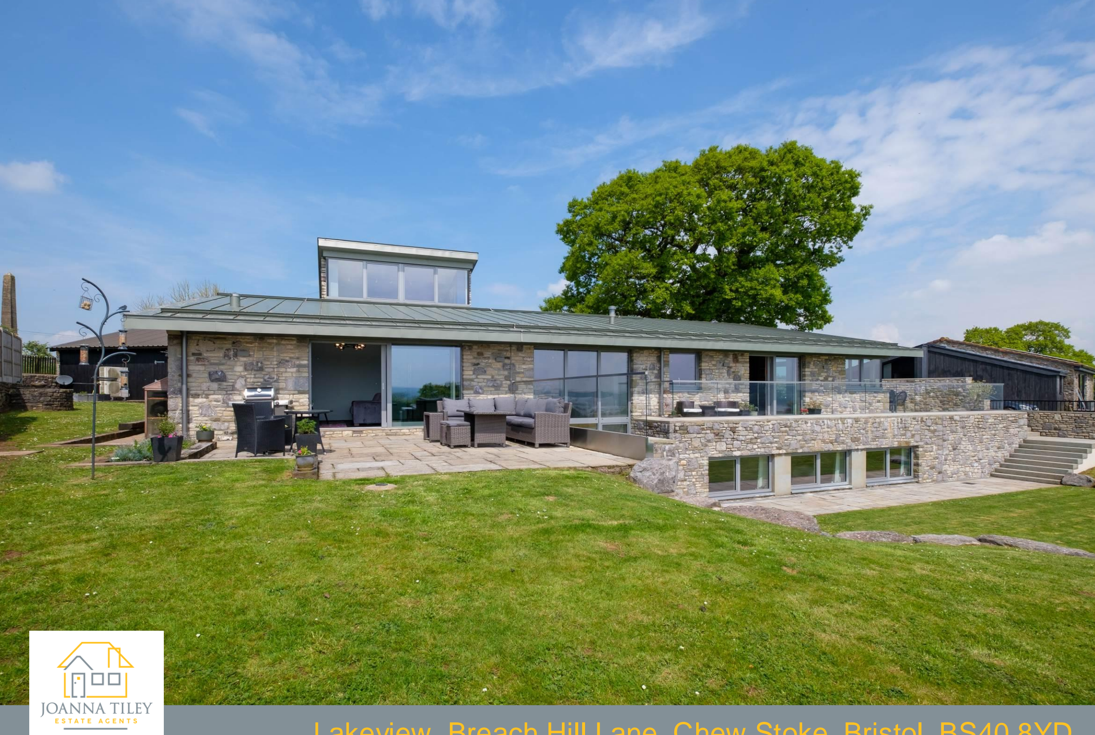
Lakeview, Breach Hill Lane, Chew Stoke, Bristol, BS40 8YD