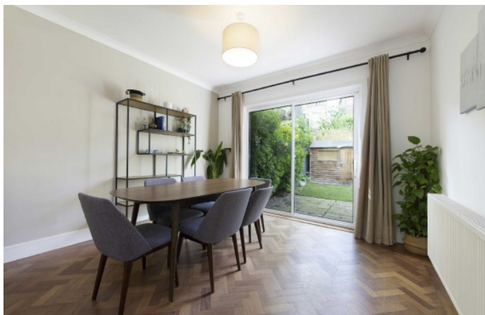
Hartham Close, N7