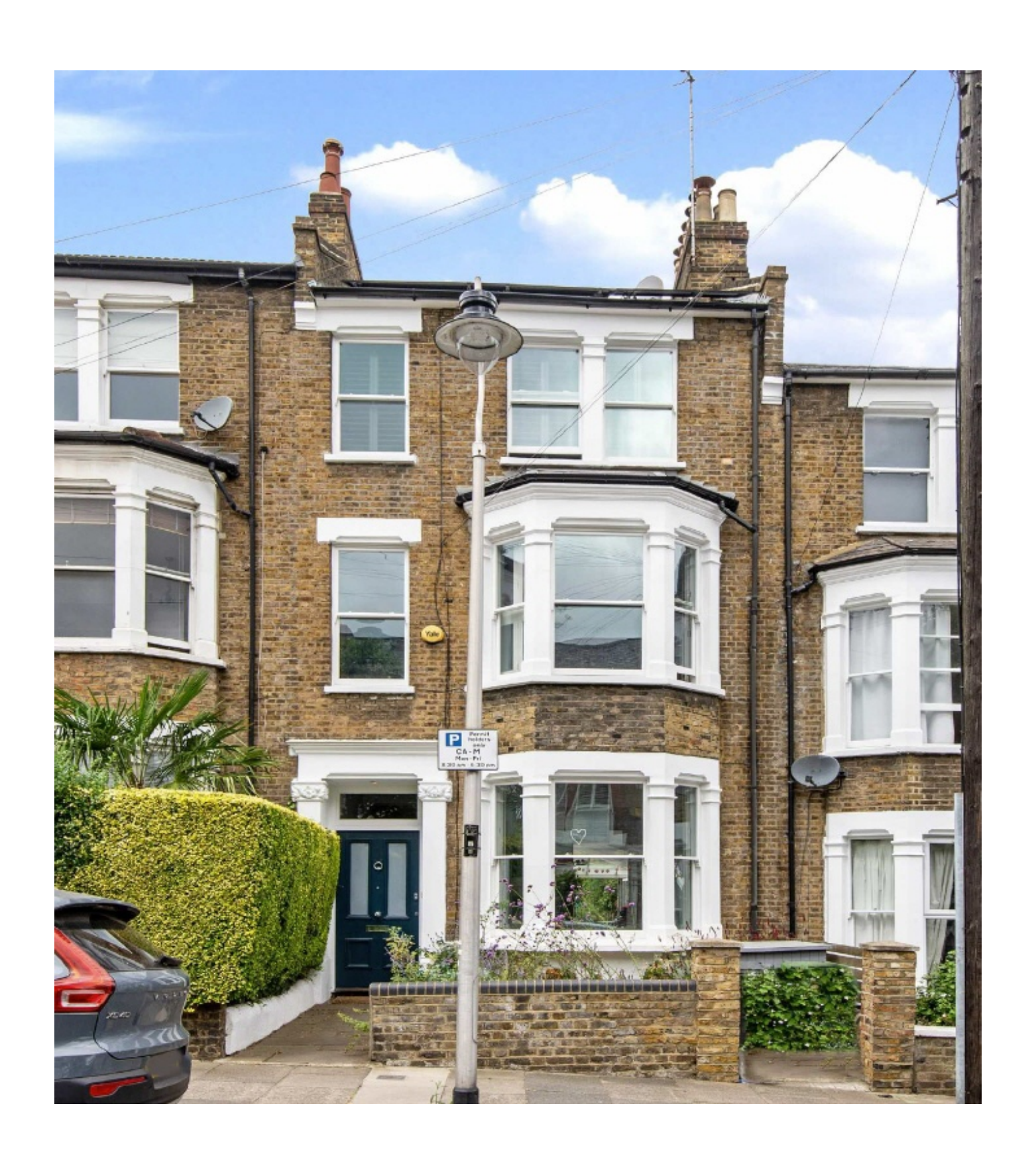
Lupton Street, NW5 £1,500 Per week