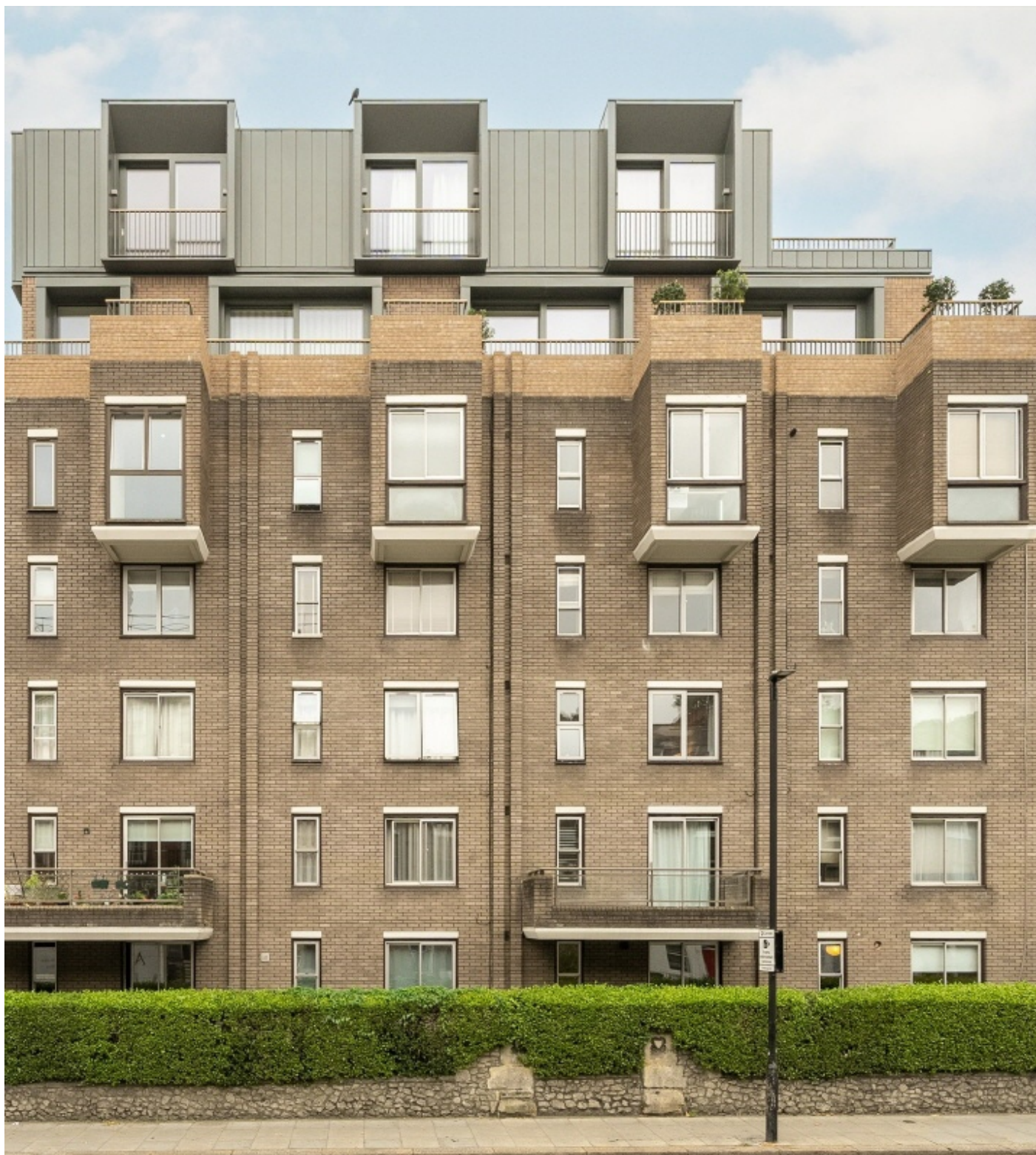
Oakley Square, NW1 £2,995,000