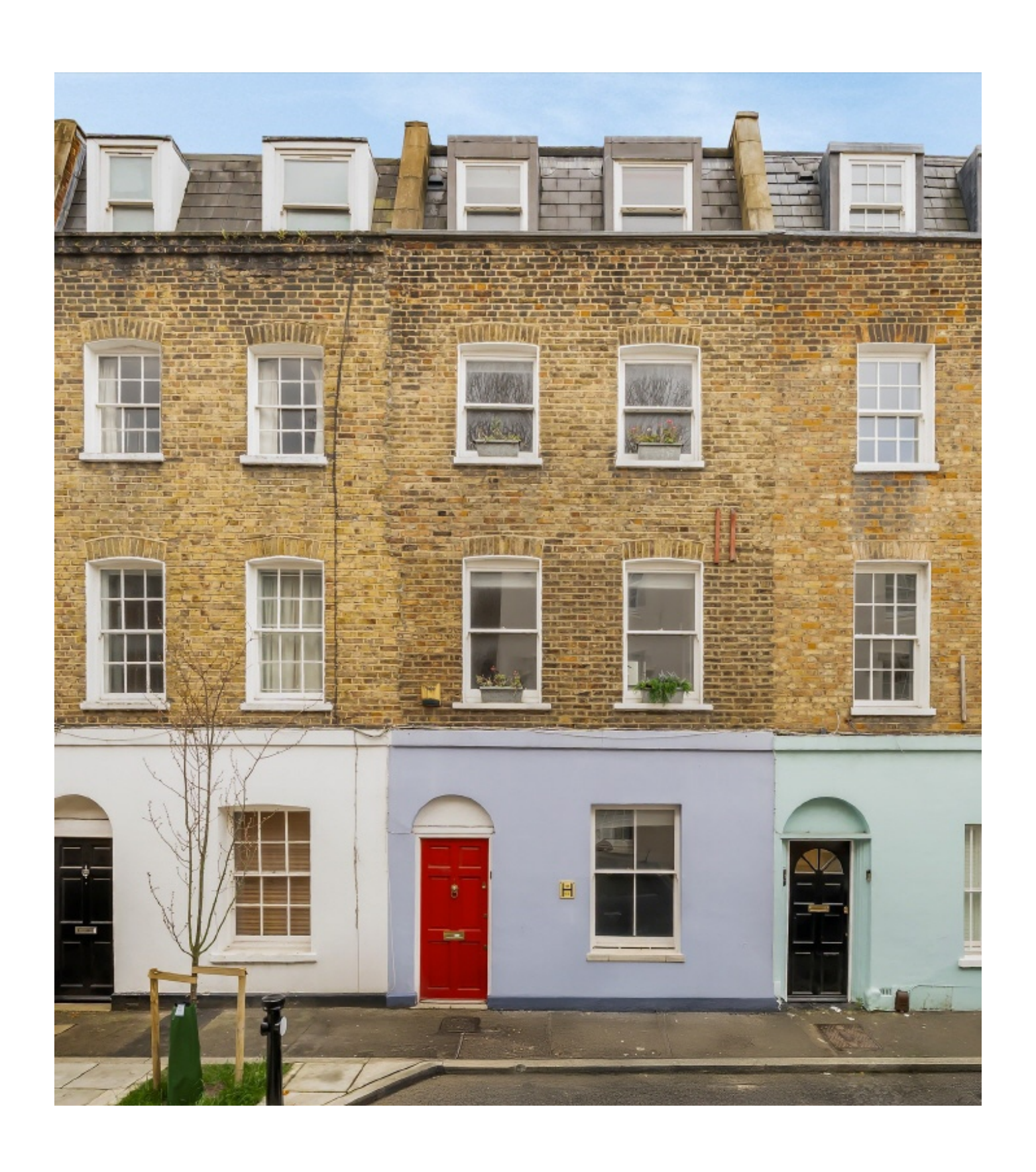
Rousden Street, NW1 £1,250,000