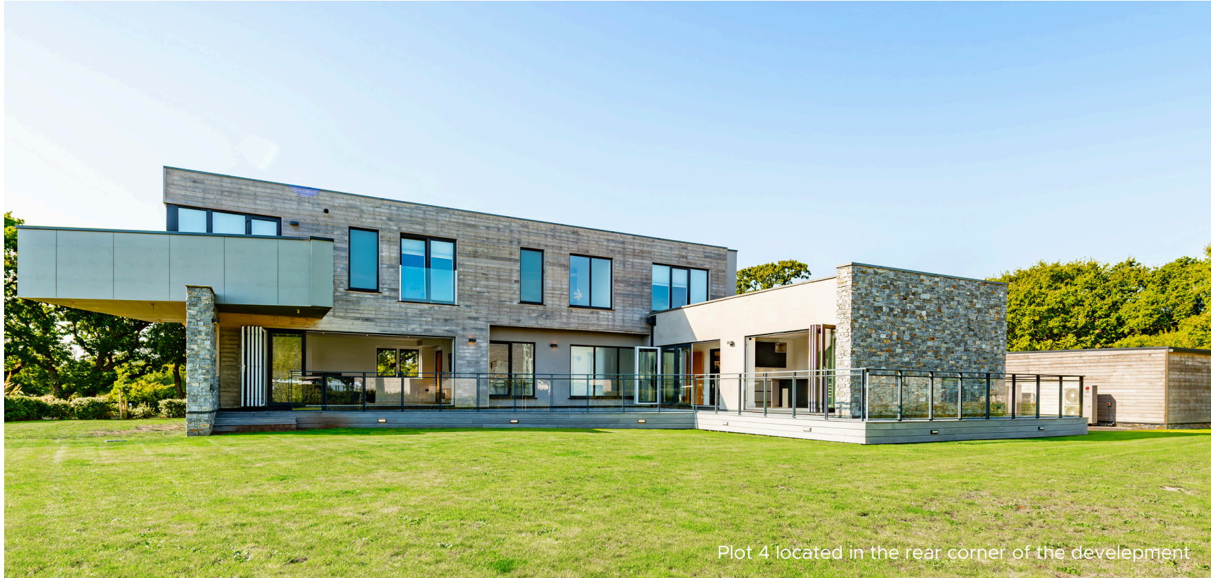
Plot 4 located in the rear corner of the development