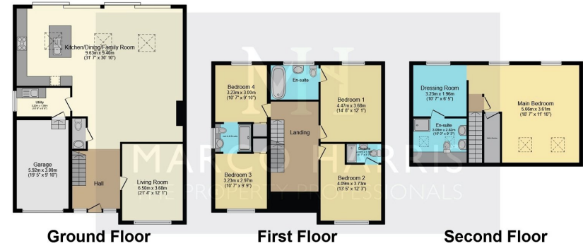
Total floor area 249.3 m 2 (2,683 sq.ft.) approx This plan is for illustration purposes only and may not be representative of the property. Plan not to scale. Powered by PropertyBox

Welcome to Chapters in Bursledon: a modern, luxurious property with striking design.