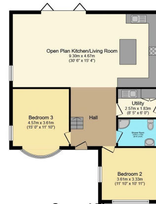
Ground Floor Floor area 91.8 sq.m. (989 sq.ft.) approx

Offering bespoke design and flexible accommodation, this property presents an exceptional opportunity and must be seen to be fully appreciated, with no forward chain to hinder your acquisition.