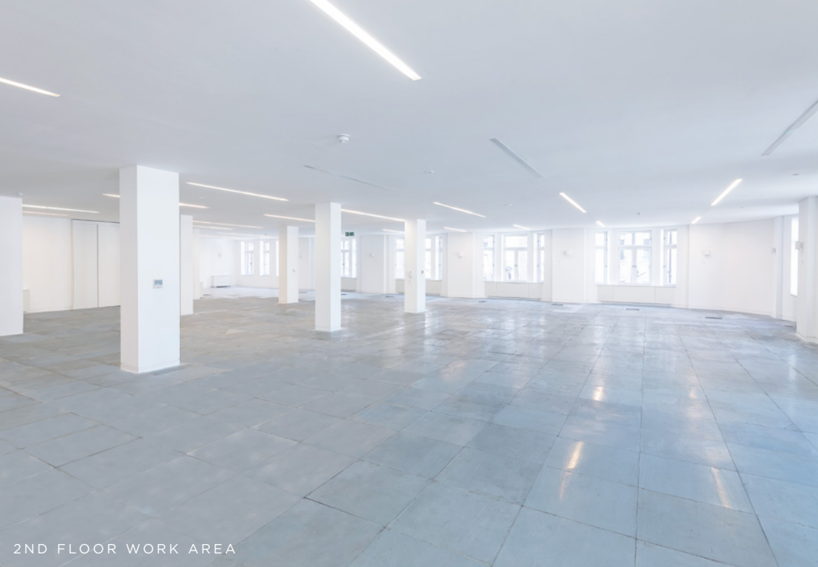
2ND FLOOR WORK AREA