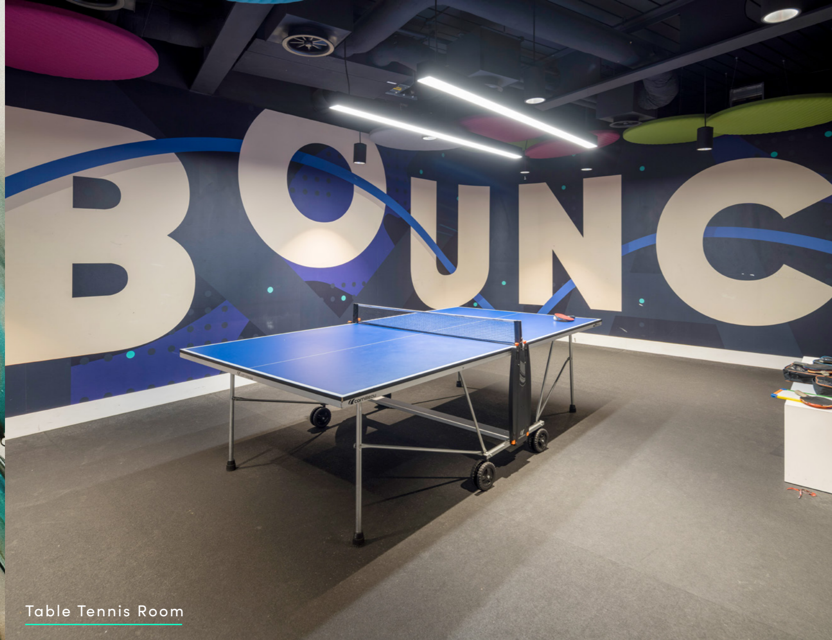
Table Tennis Room