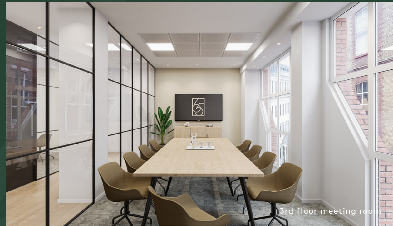
3rd floor meeting room