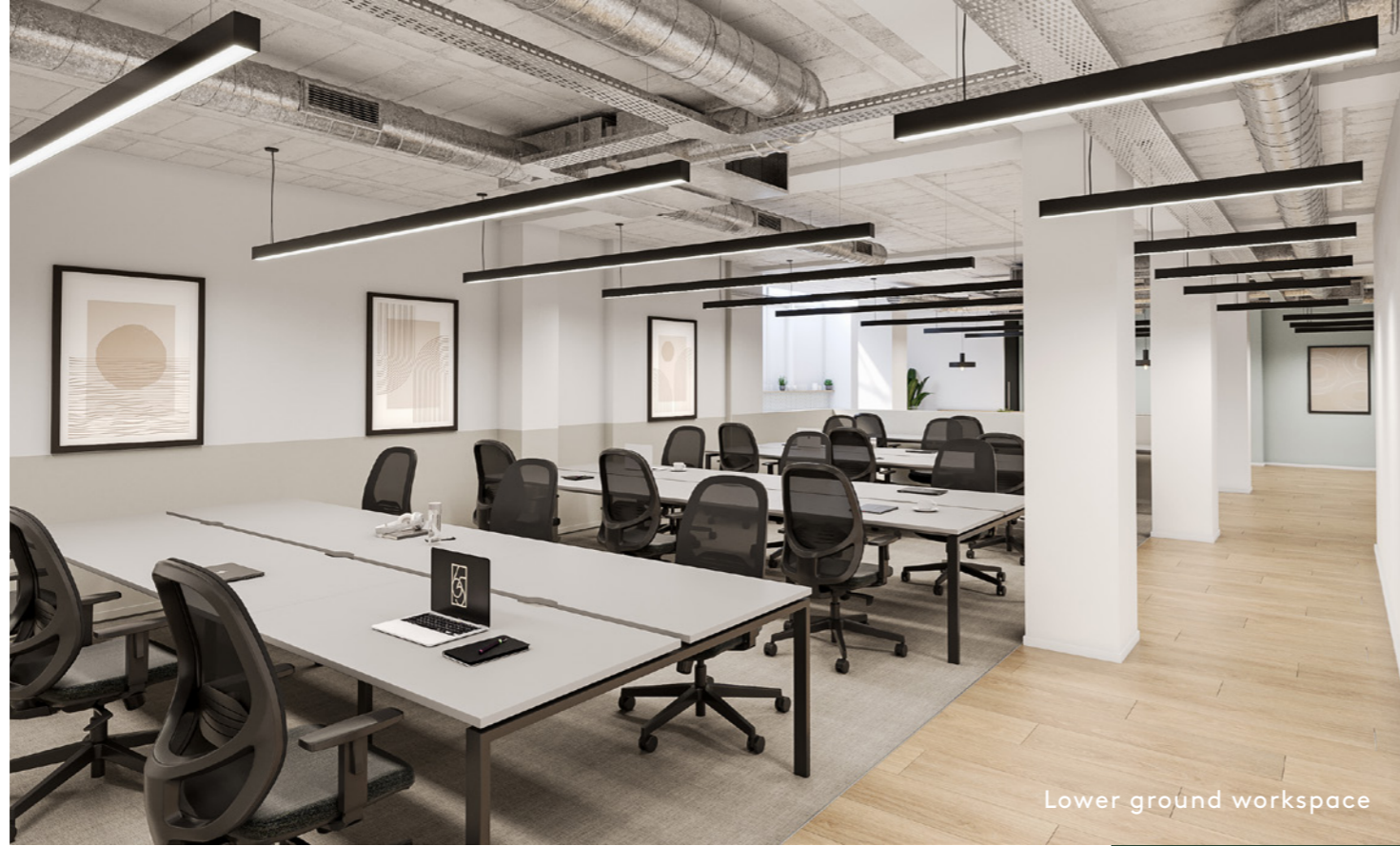
Lower ground workspace