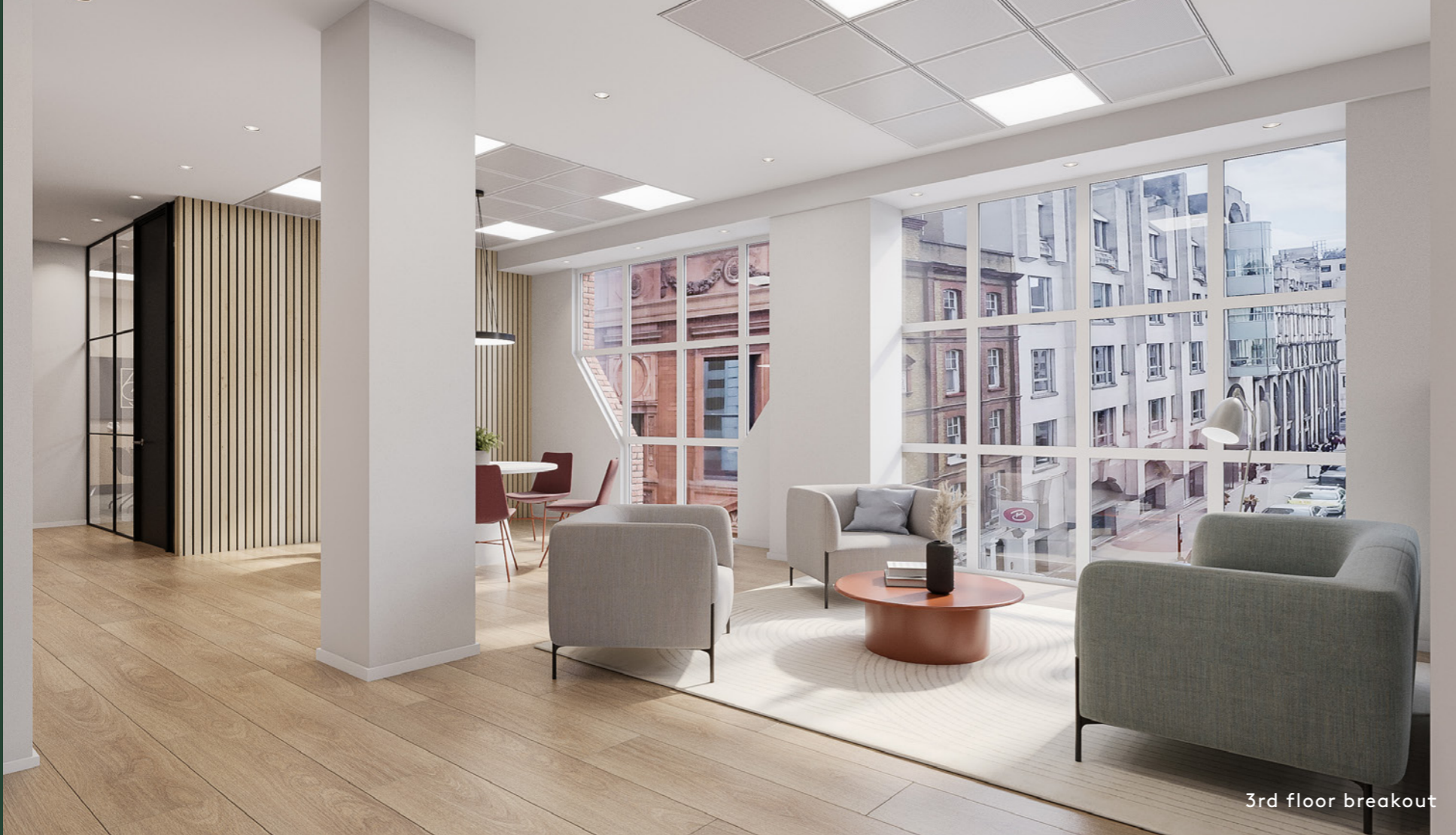
3rd floor breakout