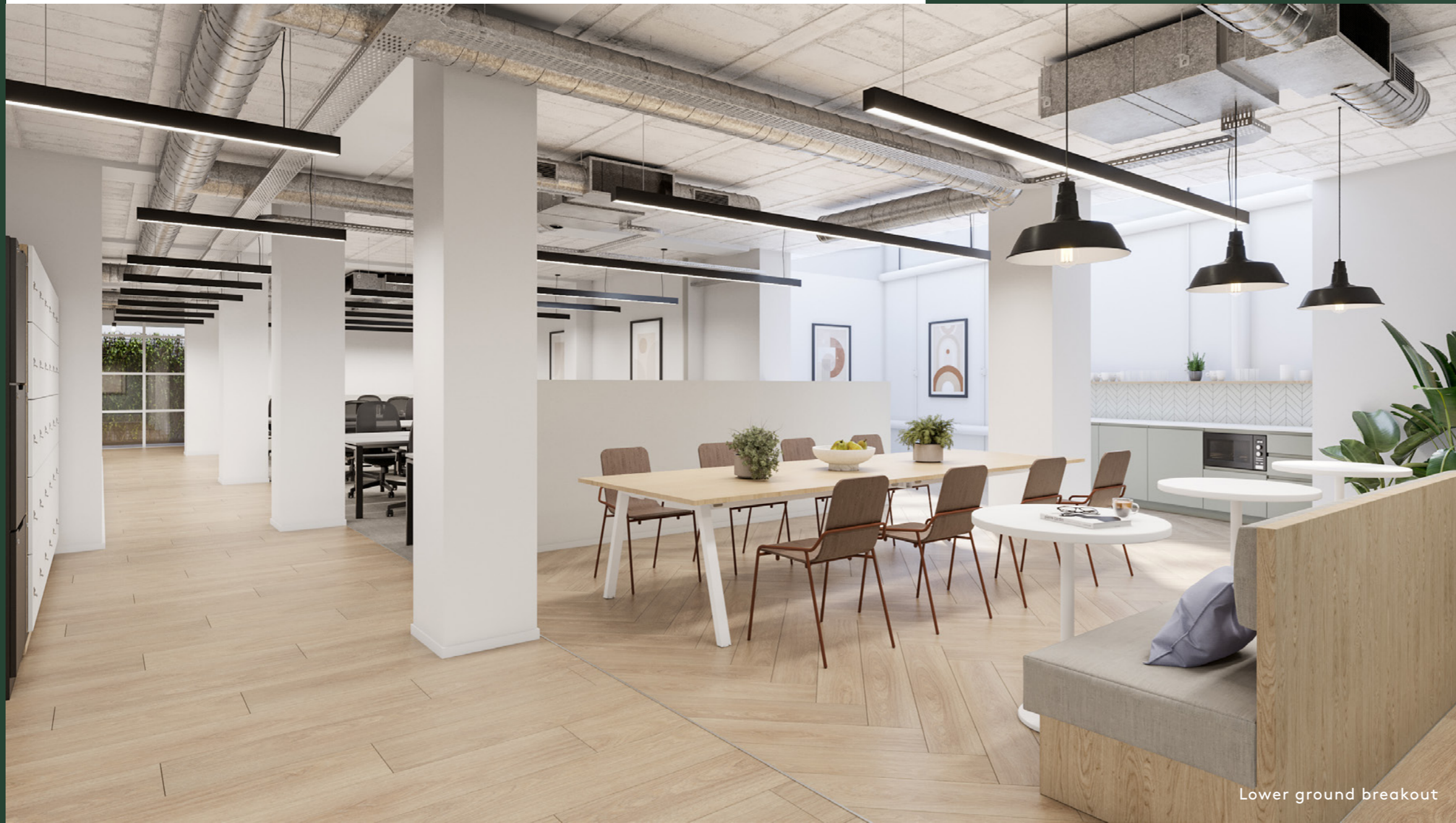
Lower ground breakout