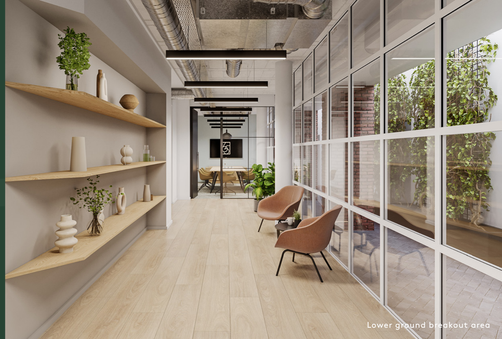
Lower ground breakout area