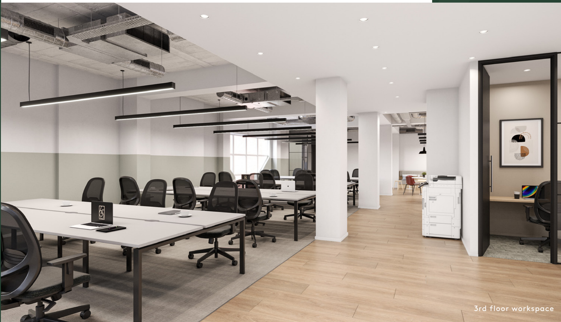
3rd floor workspace