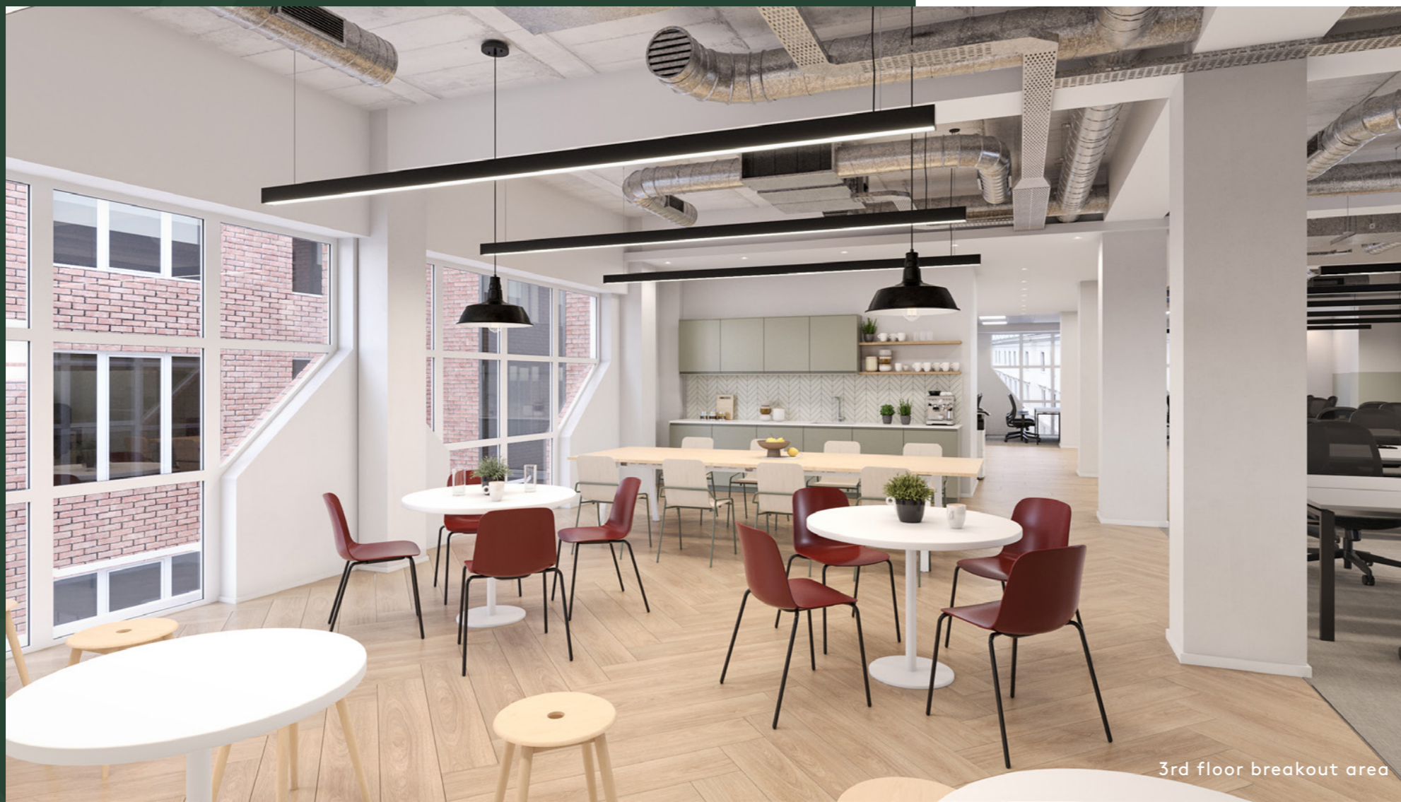
3rd floor breakout area