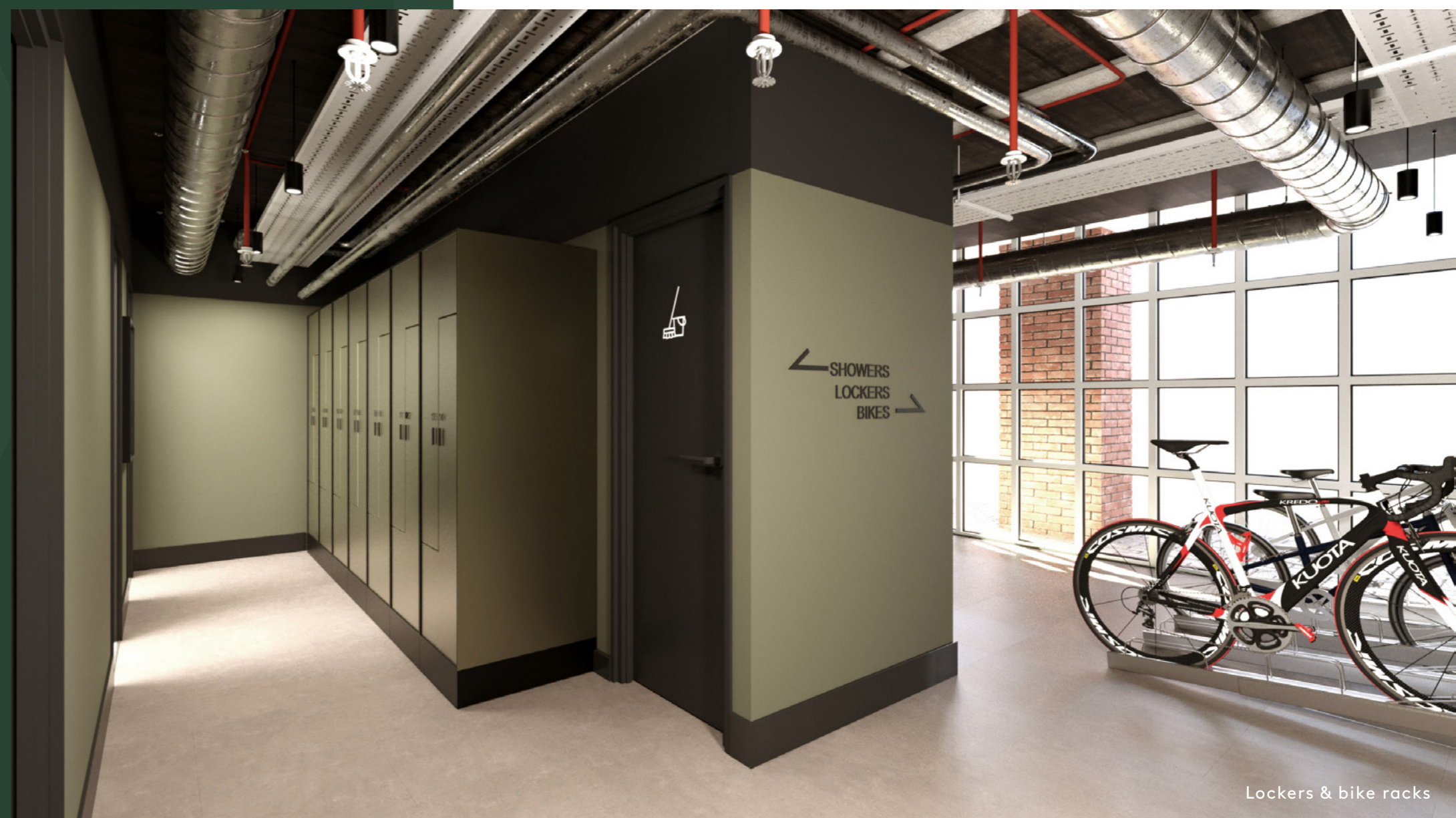
Lockers & bike racks