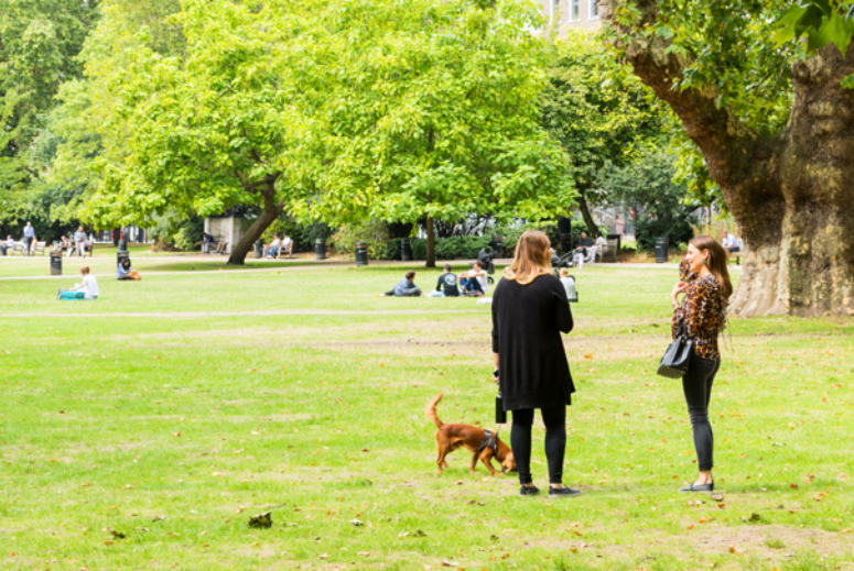
Lincoln's Inn Fields