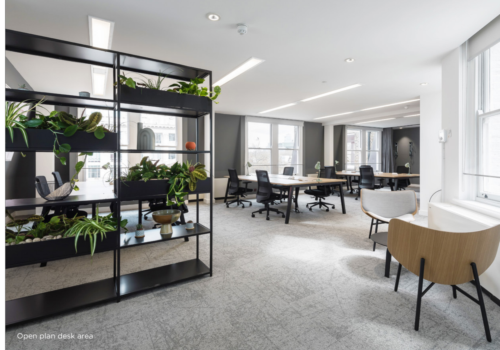
Open plan desk area