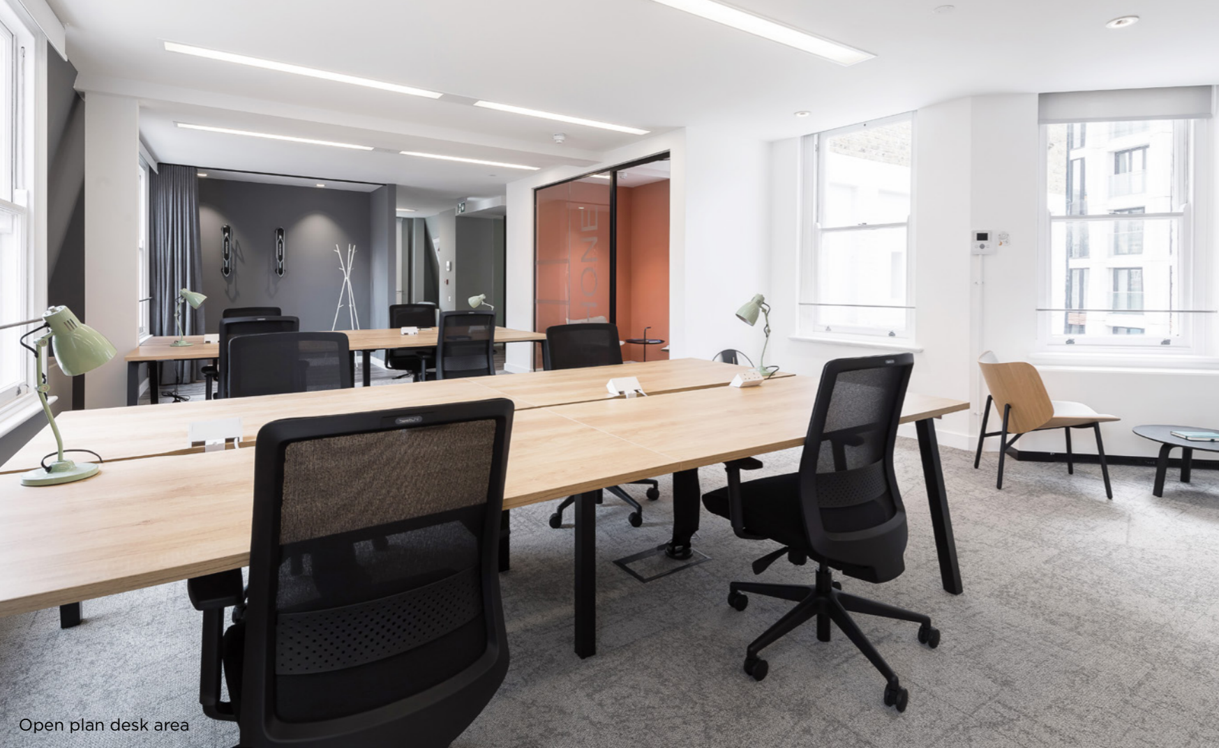
Open plan desk area