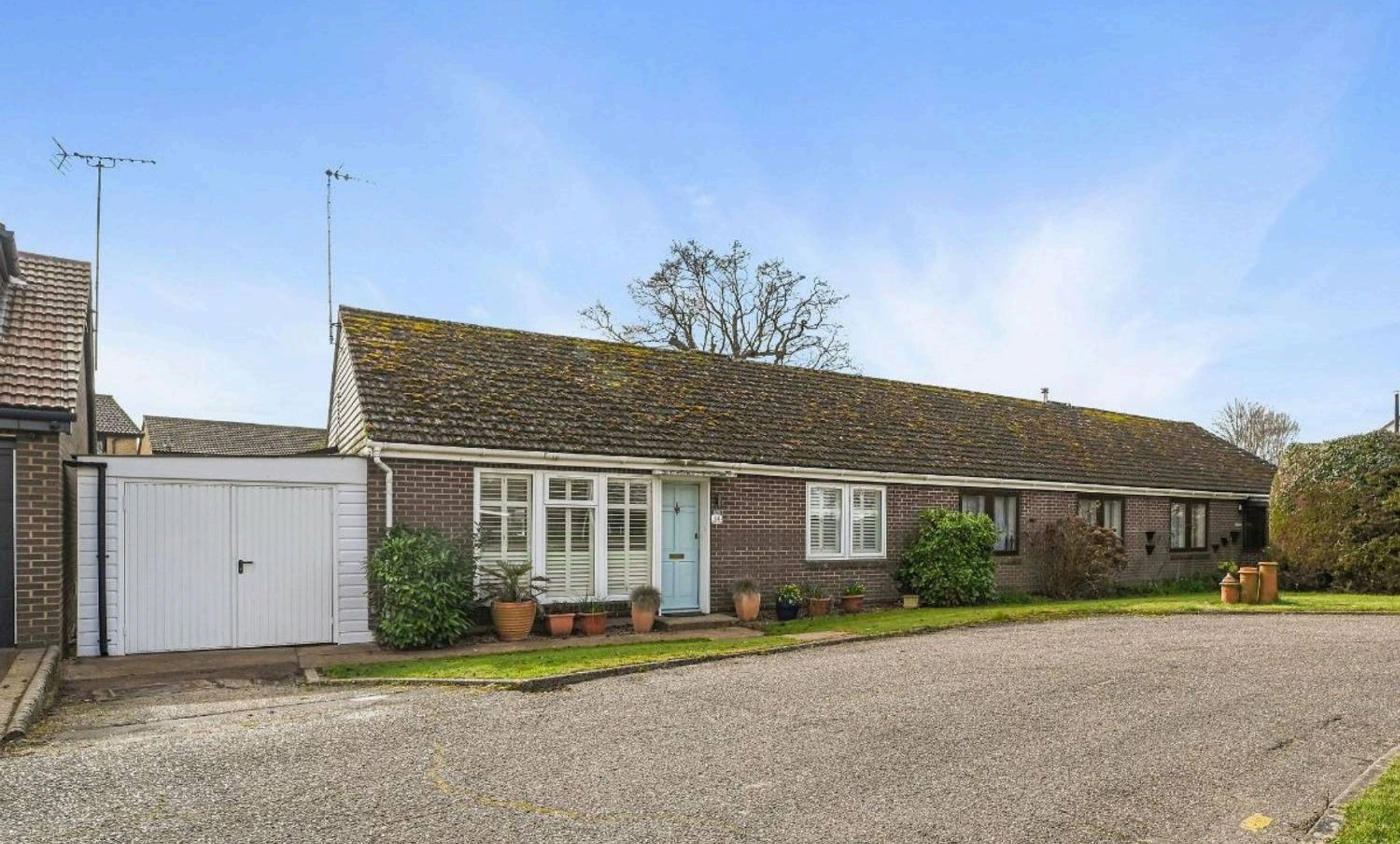
44 Suffolk Drive, Rendlesham Woodbridge