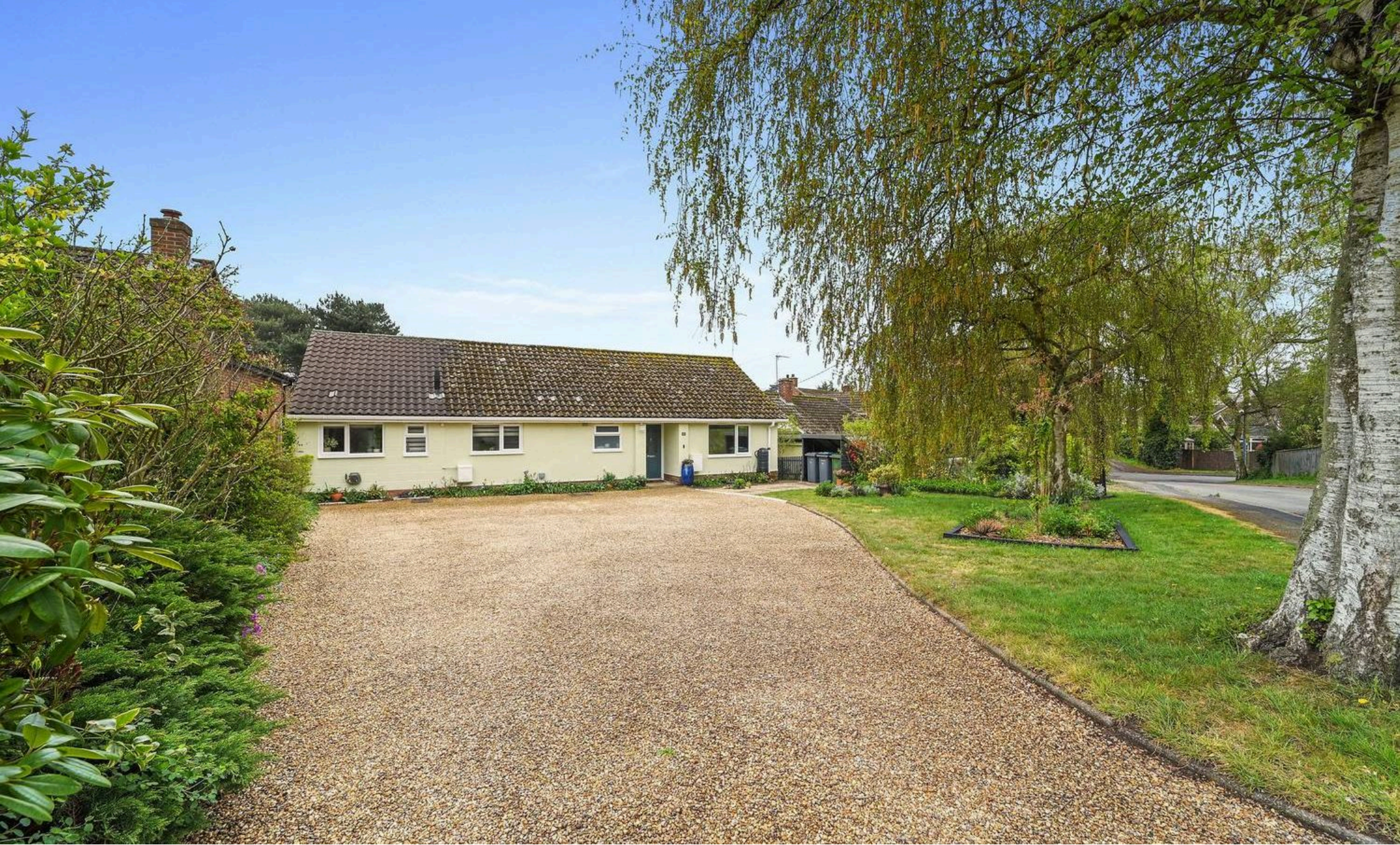
23 Through Duncans, Woodbridge Woodbridge