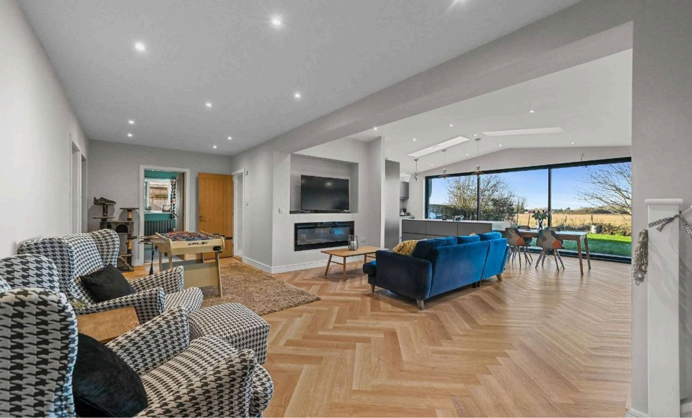
Linnets Debenham Road, Crowfield Ipswich