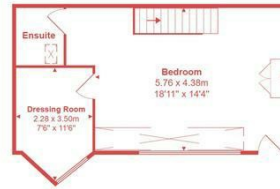
1st Floor Rear