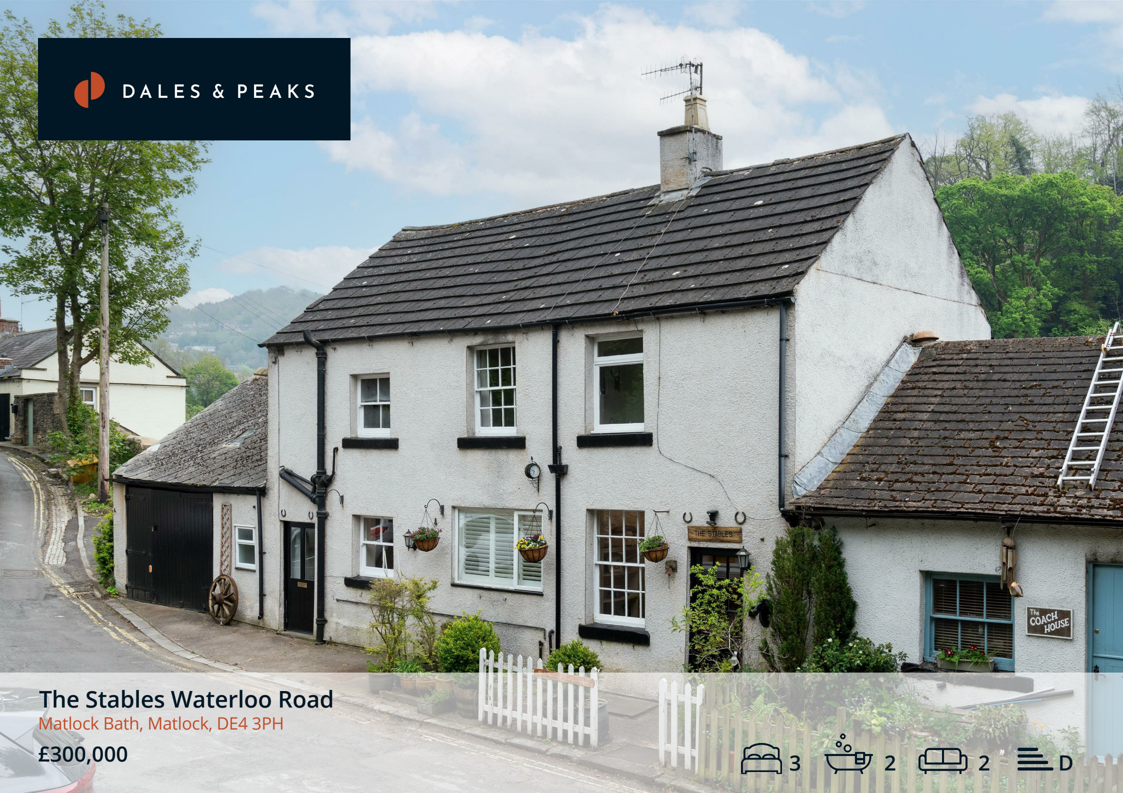
The Stables Waterloo Road Matlock Bath, Matlock, DE4 3PH £300,000