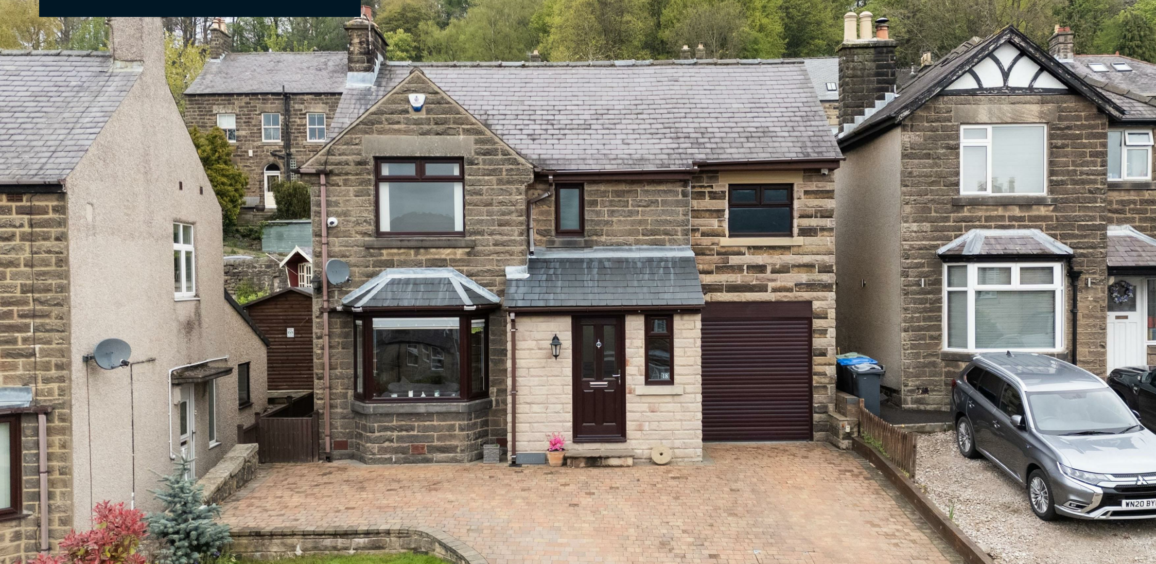
18 Crook Stile Matlock, DE4 3LJ £450,000