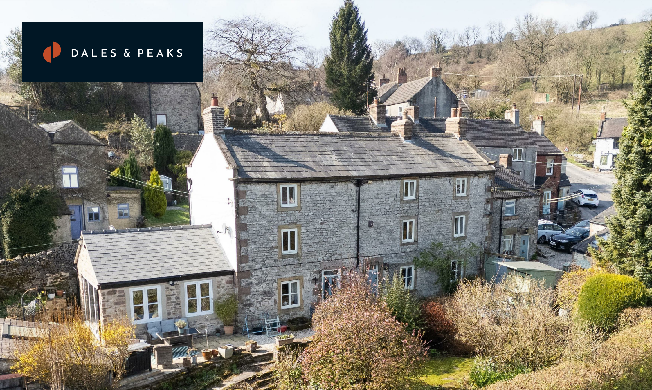
Rise End House Rise End Middleton, Matlock, DE4 4LS