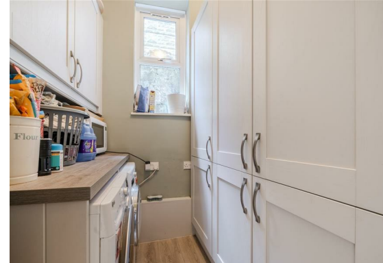
kitchen with integrated appliances, a double bedroom and bathroom.