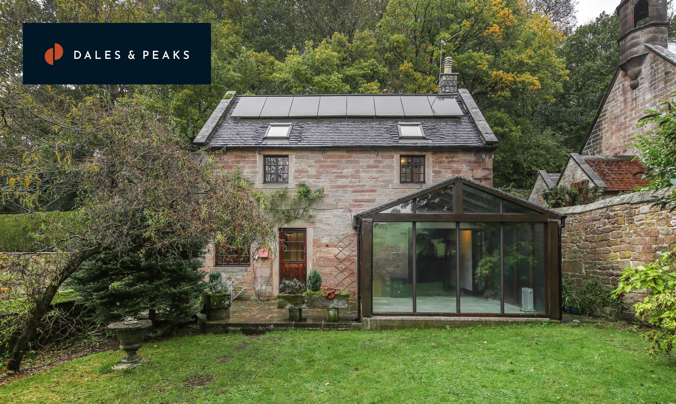
The Old Coach House Main Street Birchover, Matlock, DE4 2BL £1,000 PCM