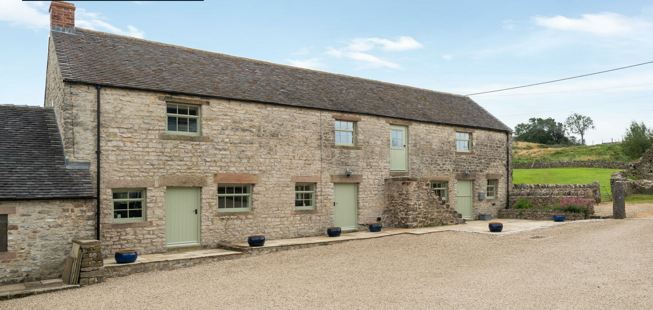
Curlew Barn Aldwark Grange Mill, Matlock, DE4 4HX Guide Price £625,000