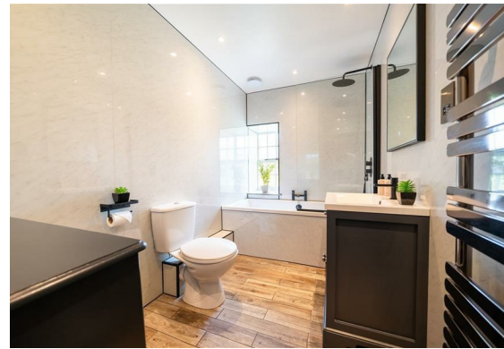
The Stables Dales and Peaks ForwardMove - Please Read