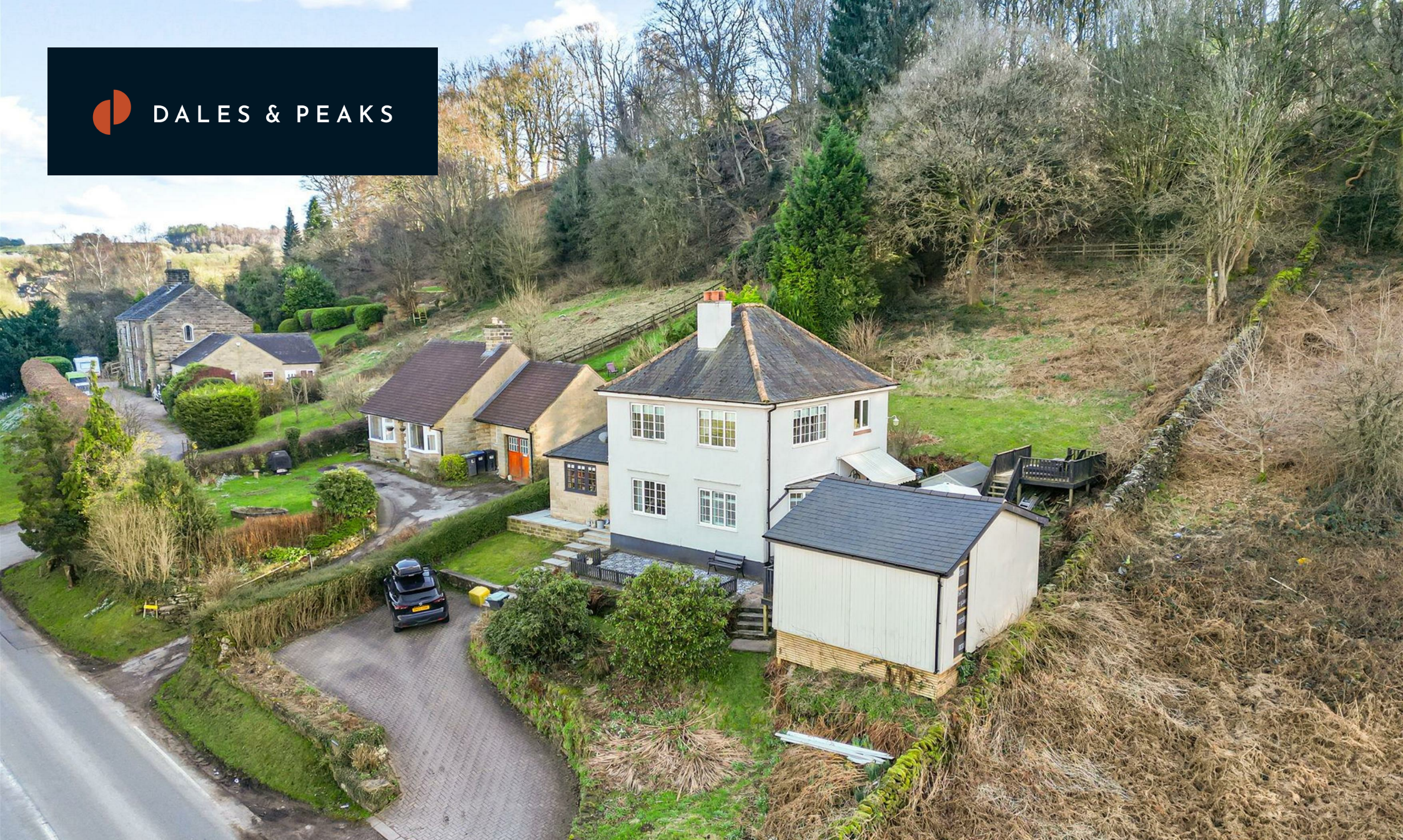
Green Gates The Cliff Tansley, Matlock, DE4 5FY Guide Price £475,000