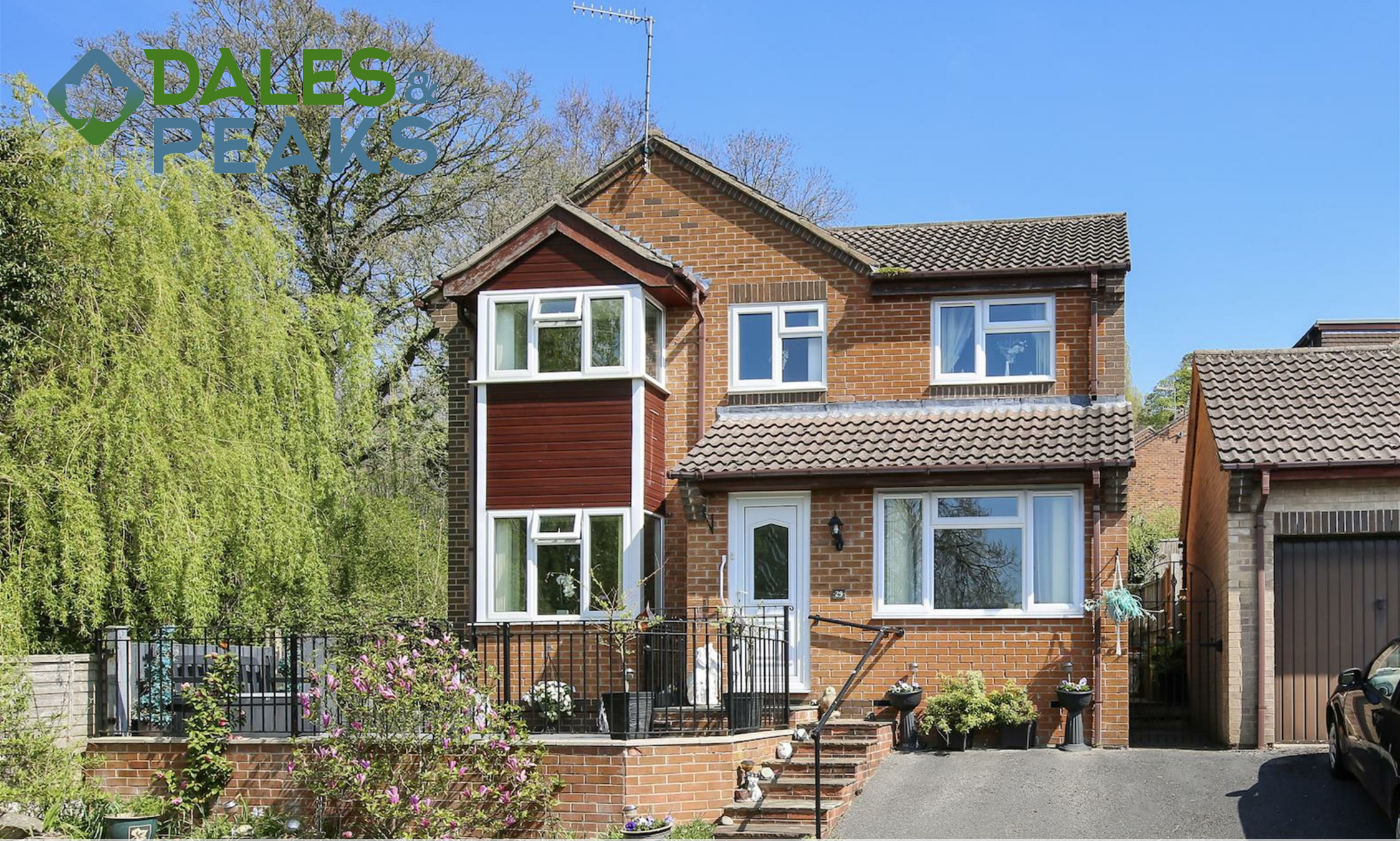
29 Stanton Moor View , Matlock, DE4 3NE