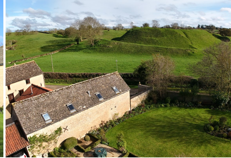
The Old Farmhouse is an elegant Georgian country home, attractively set opposite the village duck pond and next to the famous castle mount within the desirable village of Castle Bytham. The property is appealingly offered to the market with NO CHAIN.

The property is positioned within private walled gardens, with outbuildings including open fronted coach-house style carport and garaging. Approached through iron gates, this leads to a spacious driveway giving off-road parking for multiple vehicles. The beautifully maintained gardens are enclosed by high stone walls, with a spacious area of lawn, mature flower beds and shrubs to the borders and a lovely patio area to enjoy alfresco dining in the summer.