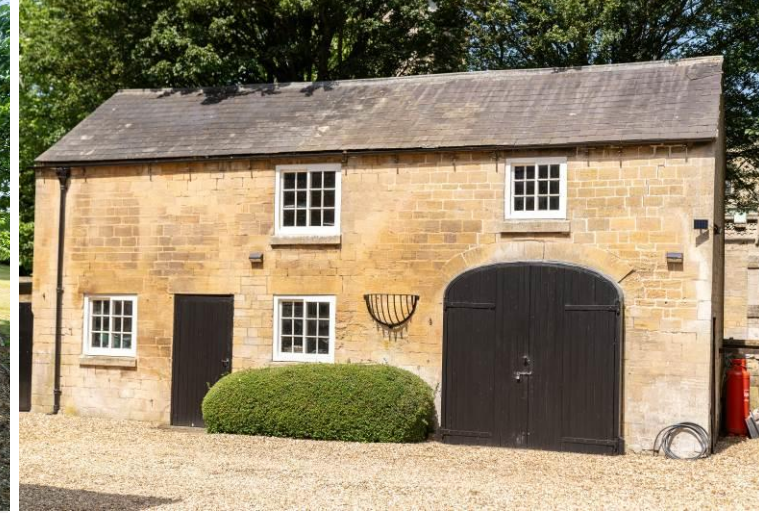
The Old Vicarage is a substantial stone country residence which has recently undergone full renovation, offering a modern finish combined with the original charming features.

The immaculately presented accommodation comprises an attractive entrance hall, dining room, living room, sitting room, newly fitted breakfast kitchen with feature island, large utility/boot room with separate access to the drive and garden, shower room and inner hallway leading to large Vale garden room giving access to the terrace. Stairs lead down to the basement which offers a large wine cellar and further cellars. Two separate staircases give access to the first floor, with two landings leading to five double bedrooms, three of which benefit from ensuite bathrooms and the further two are serviced by a main bathroom. The second floor gives a further two double bedrooms.