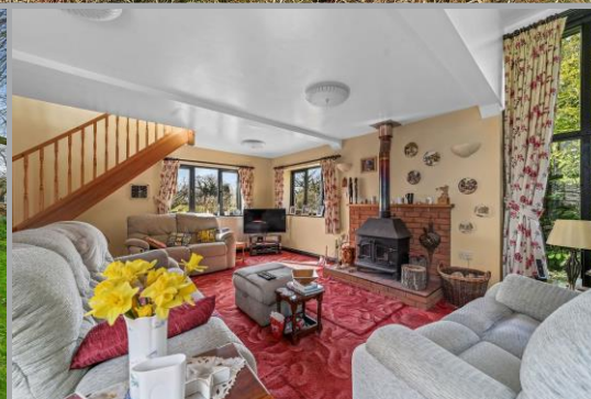
Walnut Barn | Circular Road | Baylham | IP6 8LE

Specialist marketing for | Barns | Cottages | Period Properties | Executive Homes | Town Houses | Village Homes