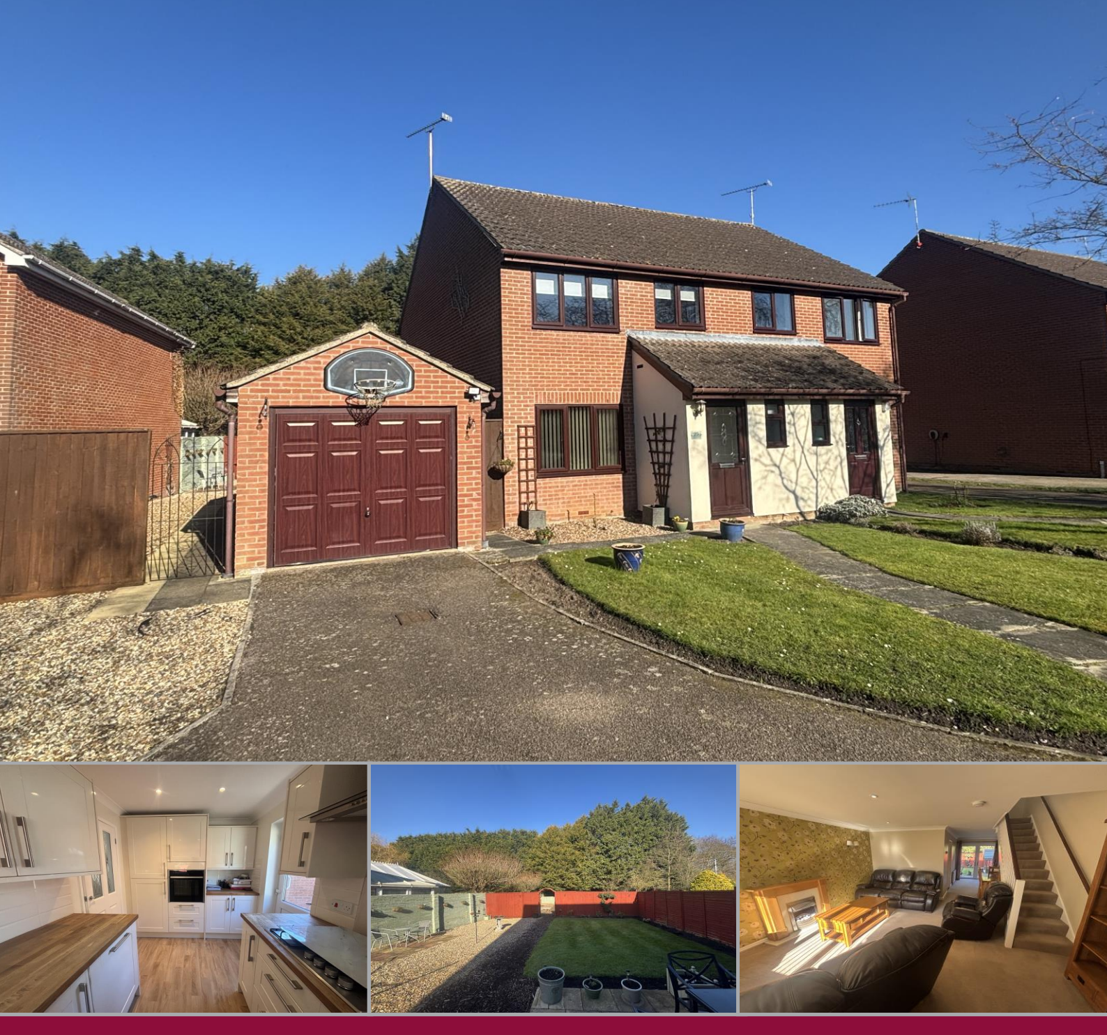
23a Luff Meadow | Needham Market | Suffolk | IP6 8DP

Specialist marketing for | Barns | Cottages | Period Properties | Executive Homes | Town Houses | Village Homes