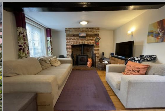
Moss Cottage | High Street | Coddham | IP6 9PN

Specialist marketing for | Barns | Cottages | Period Properties | Executive Homes | Town Houses | Village Homes