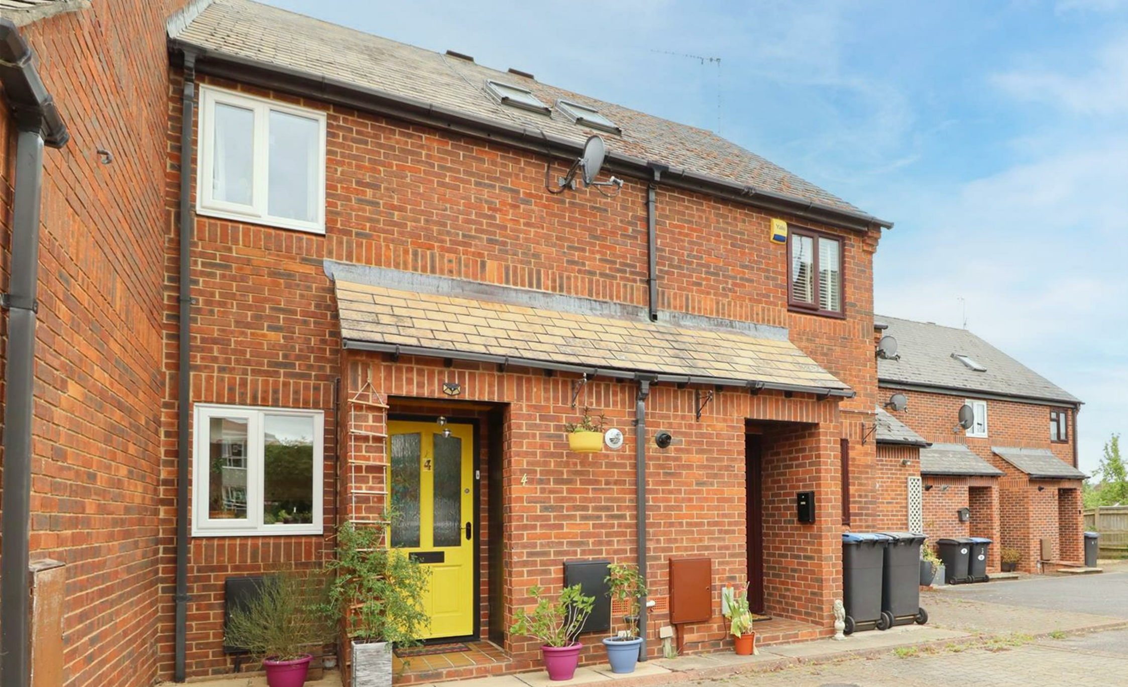
Greenways Court, Shipston-On-Stour, CV36 4DR