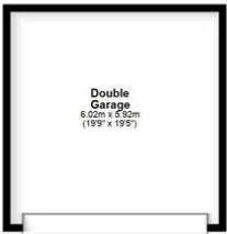
Ground Floor Approx. 237.7 sq. metres (2668.2 sq. feet)