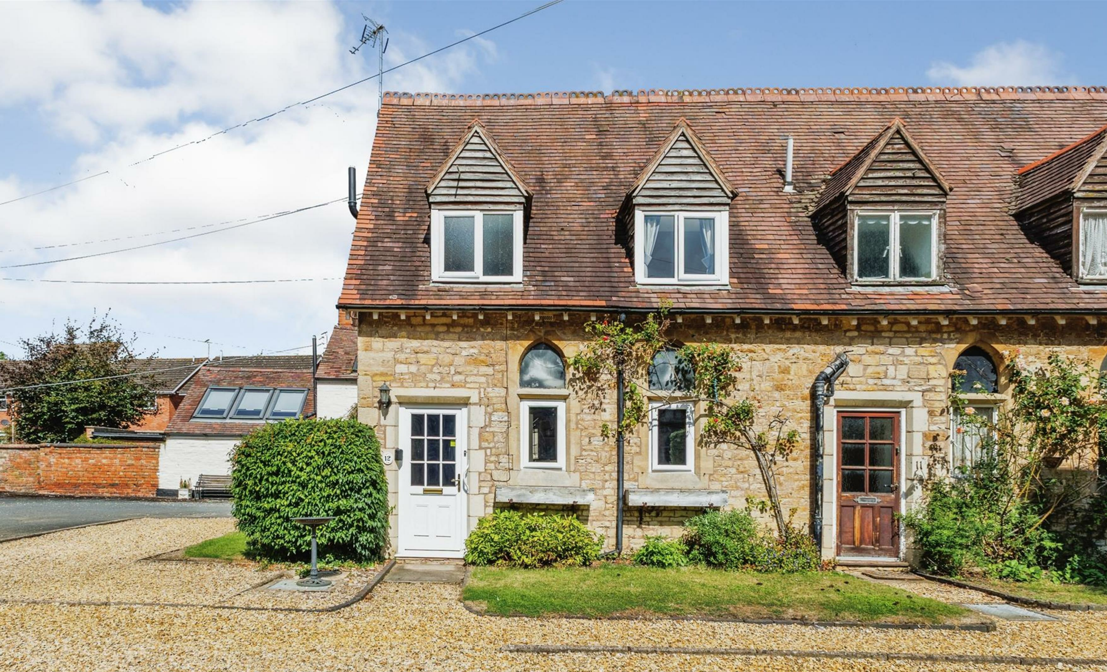
Old School House, Shipston-On-Stour, CV36 4AU