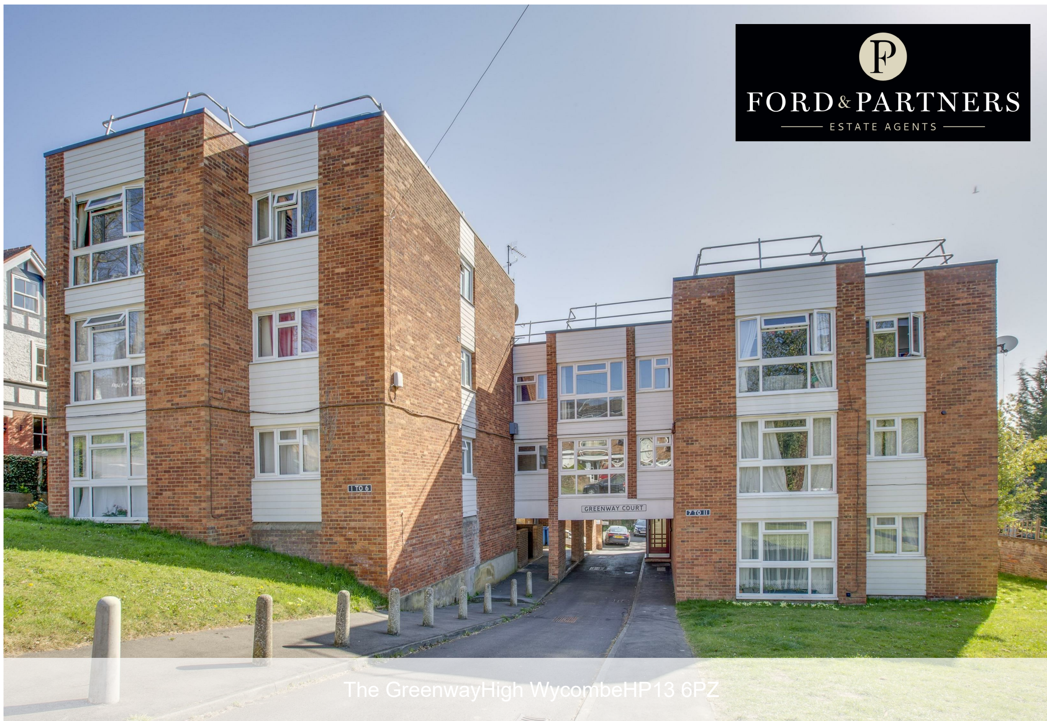
The Greenway High Wycombe HP13 6PZ